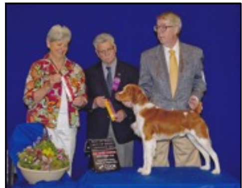
Tripp receiving Grand Champion award.